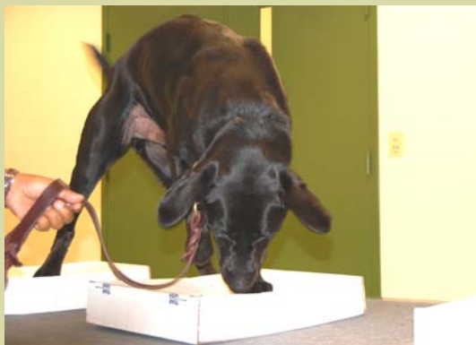
Detector Dog Tahoe finds an unmarked parcel that contains fruit

We have seen an increase in the number of newly introduced exotic insects such as Asian citrus psyllid, light brown apple moth, and Mediterranean fruit fly. An infestation of such pests could cost California millions of dollars in crop and job losses, increased pesticide use, and quarantines that impact trade. Dog teams throughout the state have detected numerous pests and diseases, demonstrating their effectiveness in the work of pest detection and exclusion.